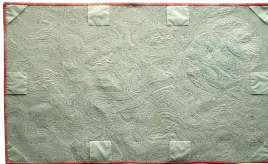
View of back of artwork