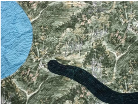
Detail image of artwork

This piece was begun in 2009 using remnants from another artwork but expanding the scale of the work. Other work and commissions seemed to always take precedence and I just wasn't sure how to bring it all together. The white and blue moons were design elements from the start. The addition of the river didn't come about until late 2014. The textural hand stitching design came to the forefront in December of 2014 and from then until Mid-March of 2015, this was the project that took over studio time. This wall artwork is intended to be hung in either a vertical or horizontal orientation, which gives it many different appearances and keeps the work fresh for collectors and viewers.